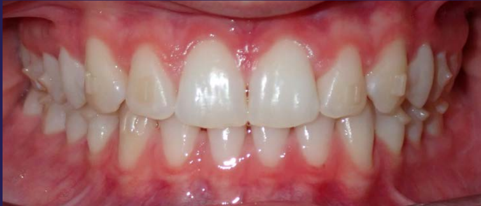
Patient in treatment with attachments