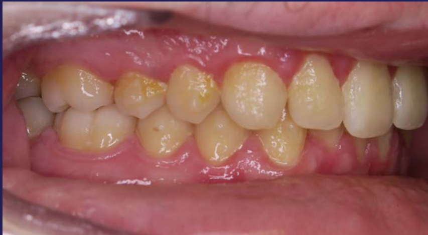
Poor oral hygiene causing plaque build-up around attachments