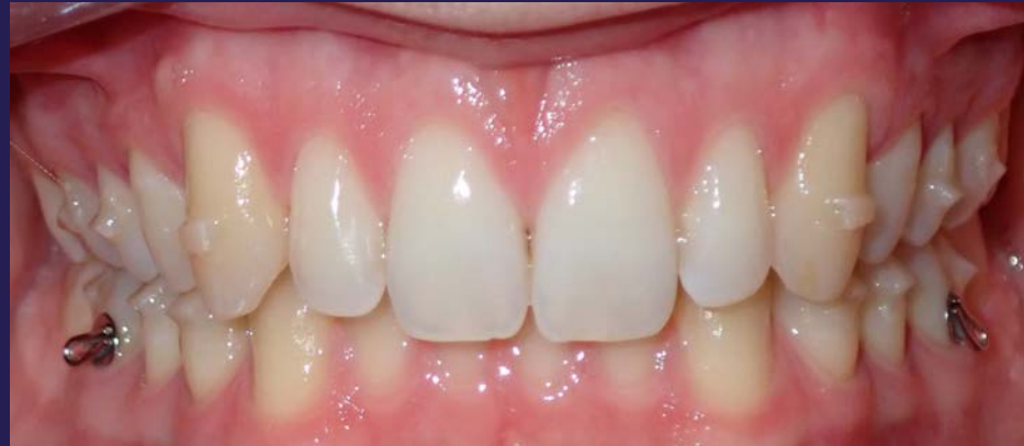
Patient in treatment with attachments and buttons