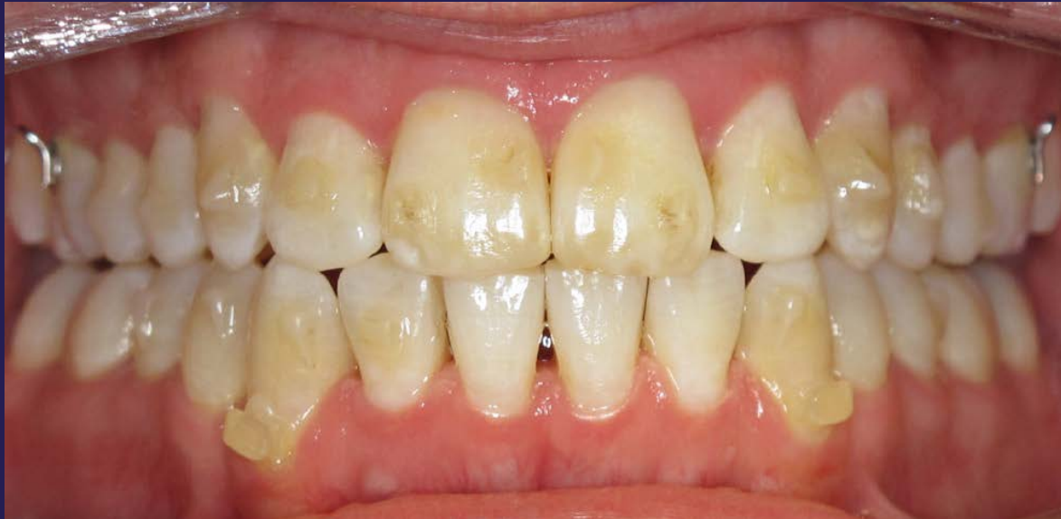
Stains that can result from smoking or poor oral hygiene