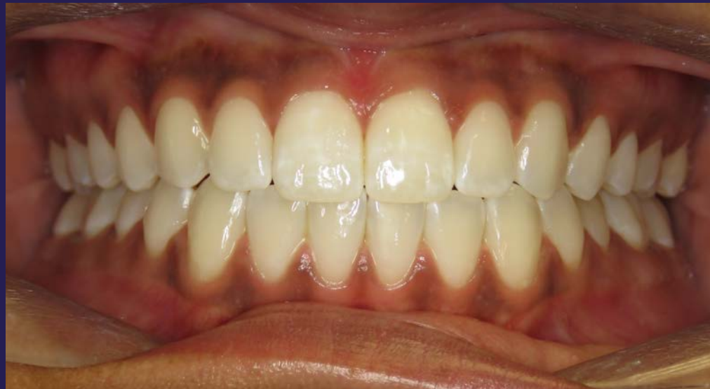
Patient after finishing Invisalign® treatment