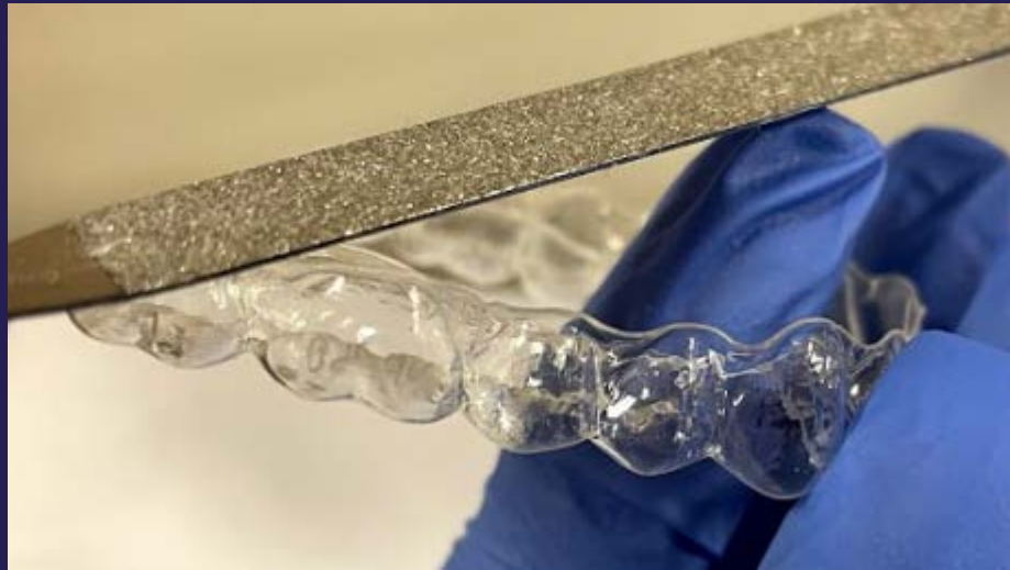
Nail file used to smooth a rough edge on an aligner