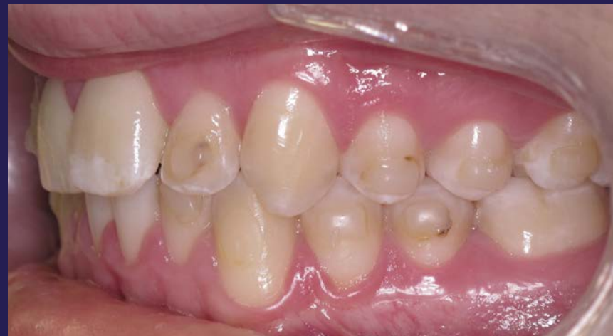
Decay, decalcification, and staining around and underneath attachments as a result of poor oral hygiene